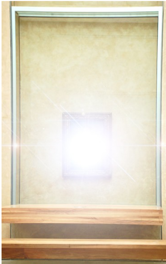
photoshop digital sketch of the idea, Their Mona